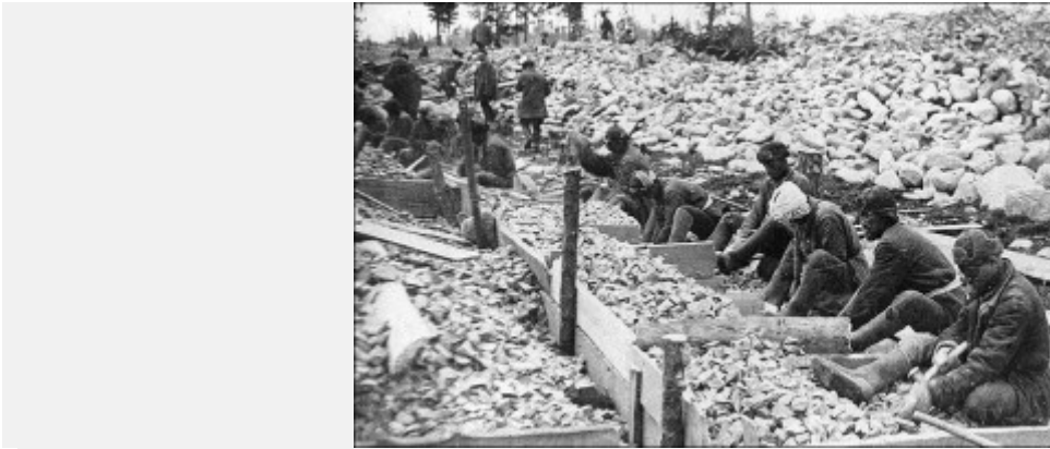
Gulag archipelago, written about by Solzhenitsyn

Once the RKM gained control over the American Money Production and Distribution, gained control over almost every member of Congress, all Presidential Candidates who would be elected, and even the Major Mass Media, they were able to seize control over almost every aspect of American life, including the educational curricula at every level of education.