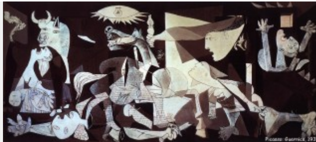
Guernica – a depiction of war by Picasso