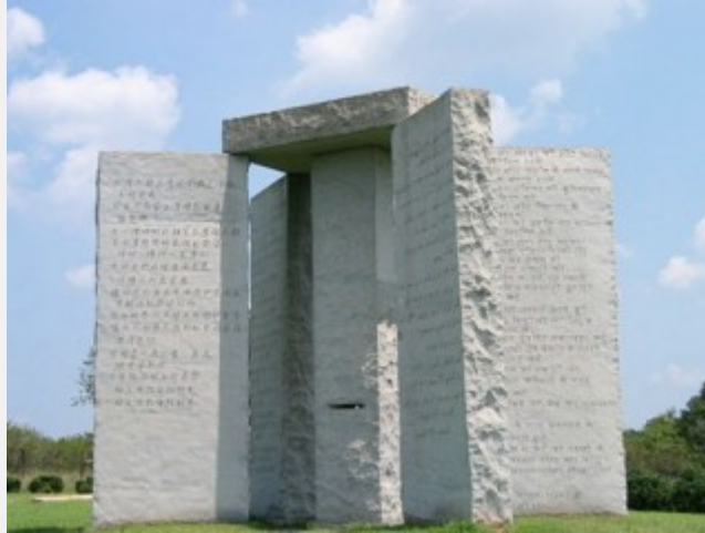
The Georgia Guidestones in Georgia, USA

Only by knowing the sinister origin and core belief system of the RKM can we understand why the RKM is hell-bent on systematically infiltrating and destroying each and every society and nation on Earth.