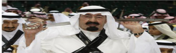
ISIS Boss's Boss