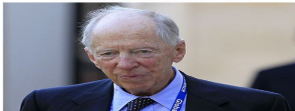
ISIS Boss's Boss's Boss's Boss's Boss