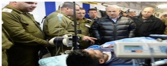
ISIS Boss's Boss's Boss' Boss