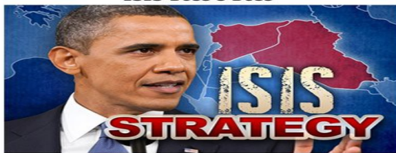
ISIS Boss's Boss's Boss