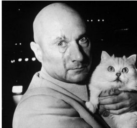
SPECTRE in 1960s Bond movies

And now for the real reason behind all this , which is so evil, it is unfathomable and unimaginable. The Select few are the top controllers of the Khazarian Mafia and sit in its notorious “Circle of Twelve” and control their evil, criminally insane Establishment Hierarchy, which it seems like, is the group “SPECTRE”, right out of a James Bond movie.